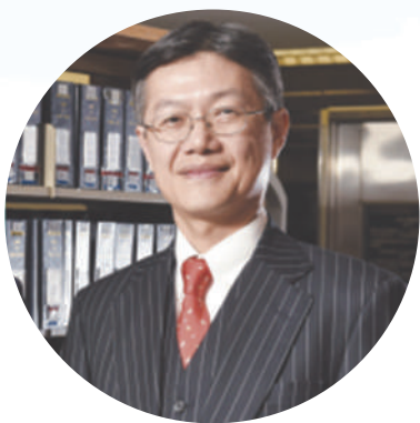
毛錫強律師 (現任律政司副法律草擬專員)